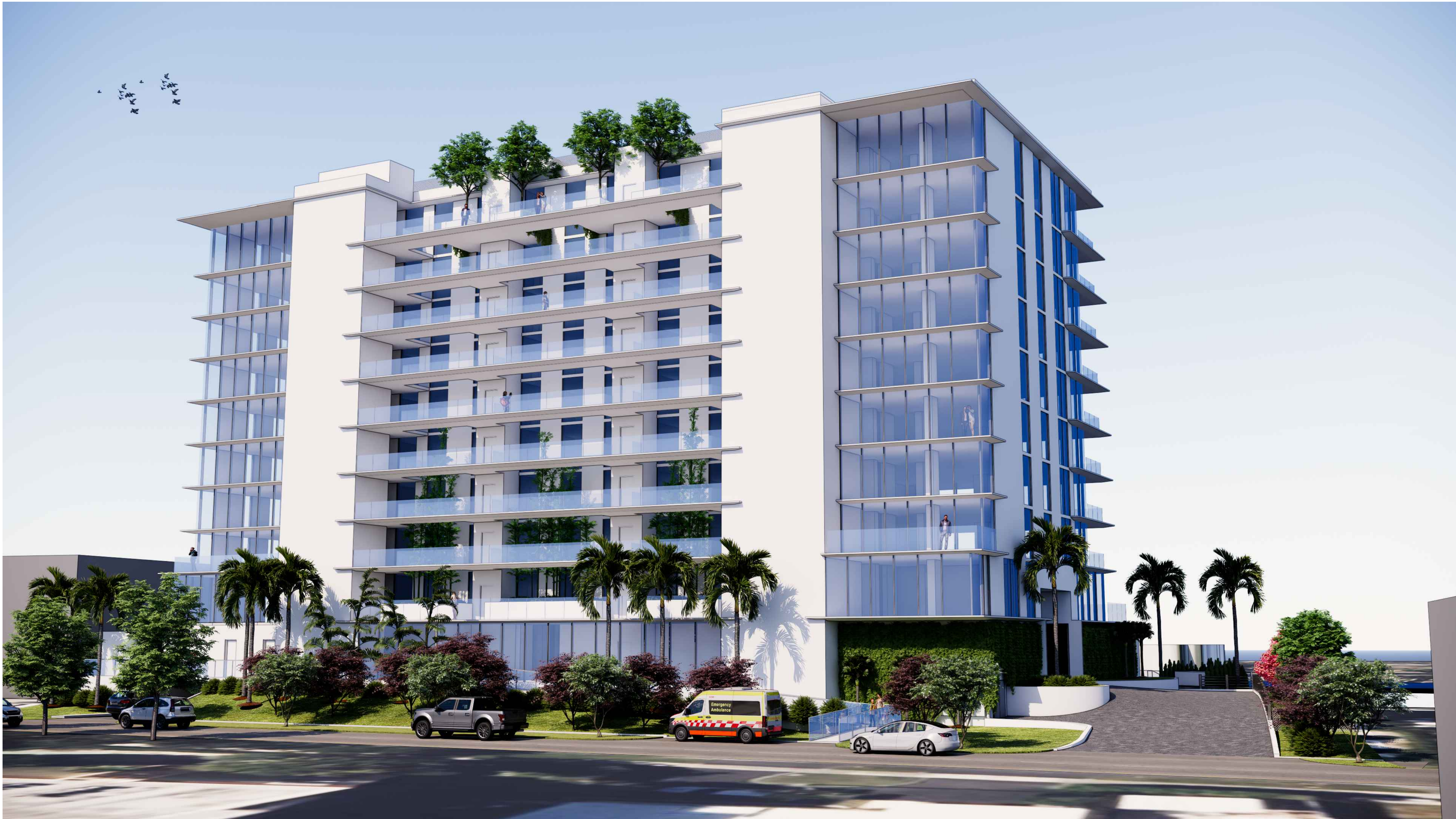
View from North-East Corner, looking South-West